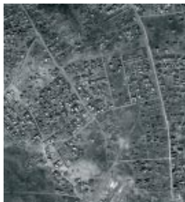
B Falludjah, November 24, 2004