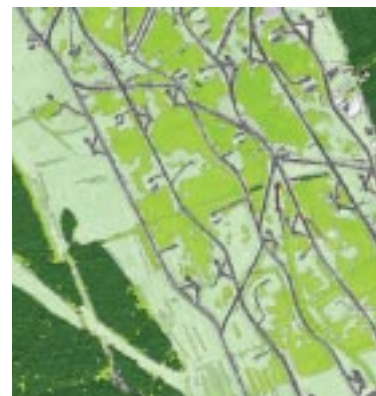
C Basic land cover polygons (detail)