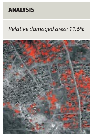
C Vector layer: distorted buildings