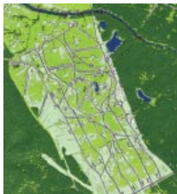
B Basic land cover polygons