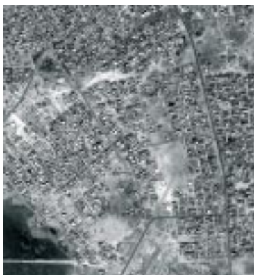
A Falludjah, September 12, 2004